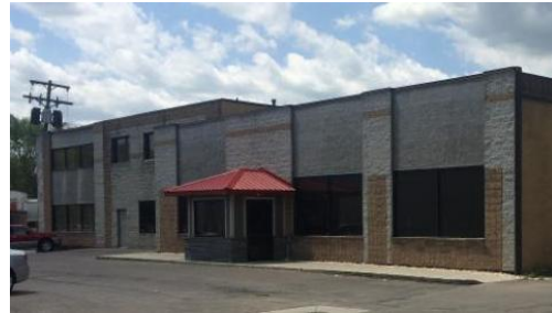
new home for Getthere

The new location will provide quality work space for our growing staff and improve operating efficiencies. Our five-county service area remains the same. Our mission remains the same while we offer increased services, such as our Transportation to Employment Program and our new and improved Website with Trip Planner capacity described below.