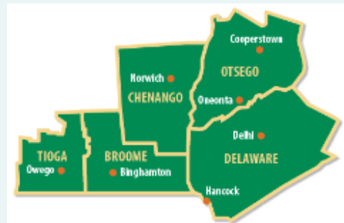
Getthere's five county service area